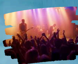
Live Band Performance