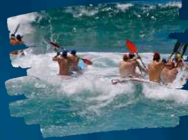
Surf Ski Race