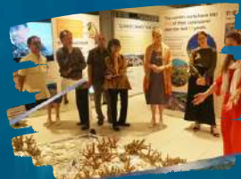
Marine Life Exhibition