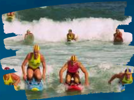
Rescue Board Race