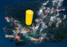
Sea Swimming Race