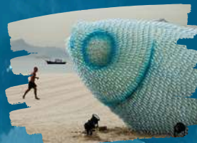
Marine Life Art Insulations