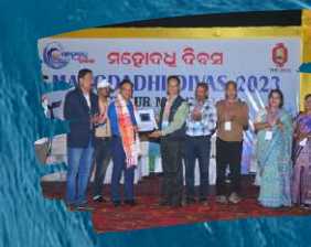
MAHODADHI Award Presentation